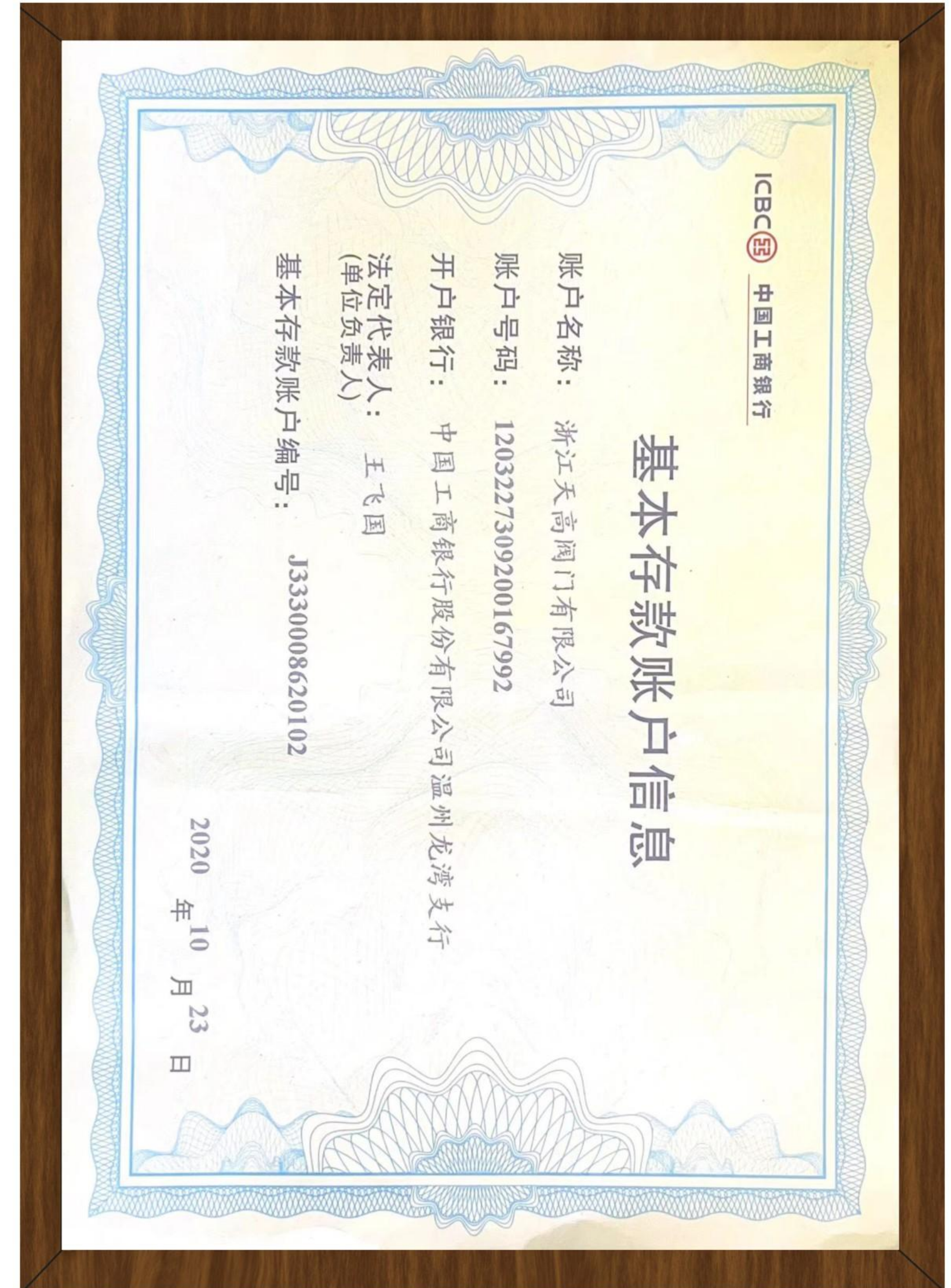
基本存款账户信息 BASIC DEPOSIT ACCOUNT INFORMATION