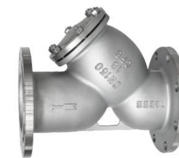
Y型过滤器 Y Type Strainer