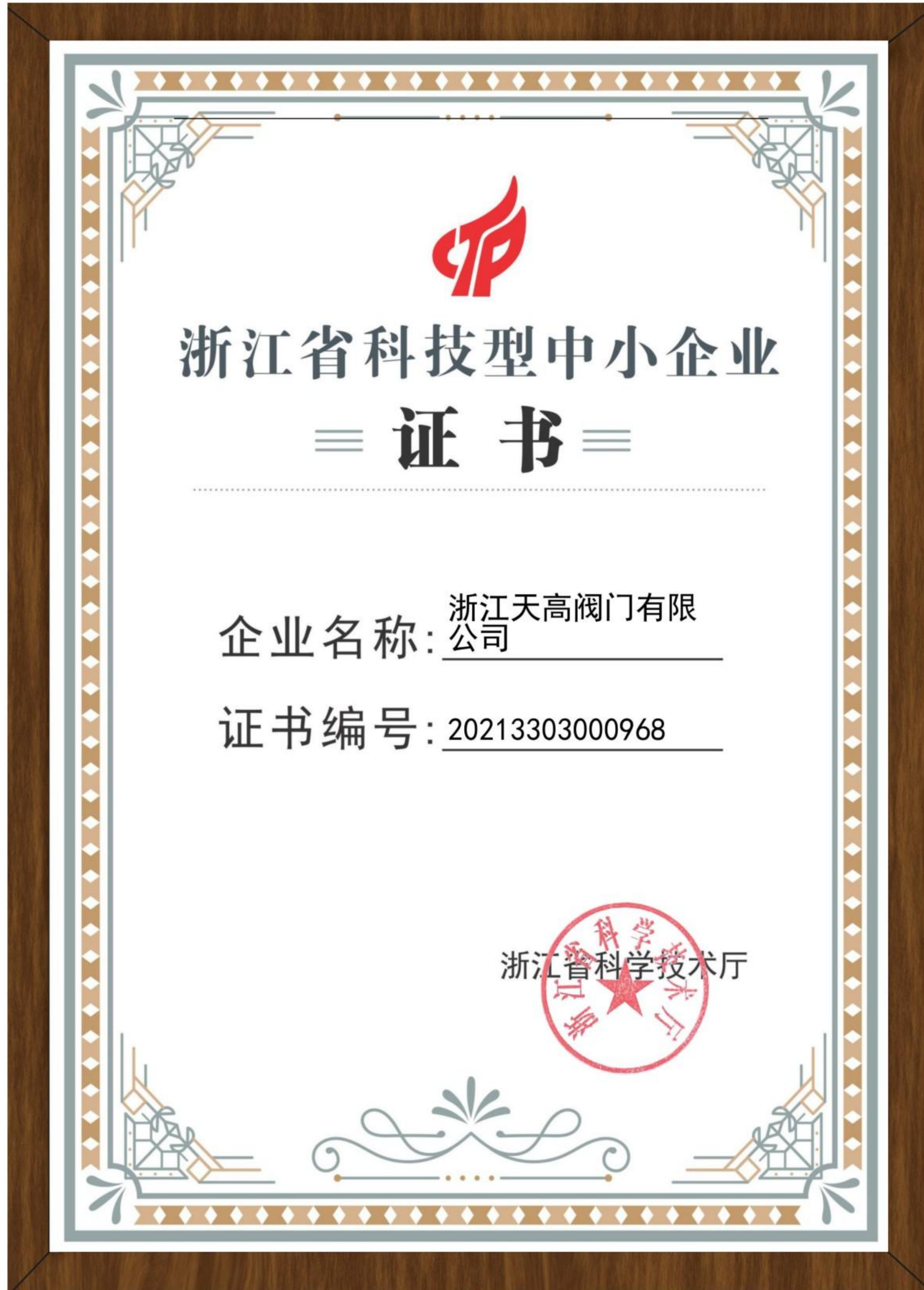
浙江省科技型中小企业证书 ZHEJIANG PROVINCE SCIENCE AND TECHNOLOGY SMALL AND MEDIUM ENTERPRISE CERTIFICATE