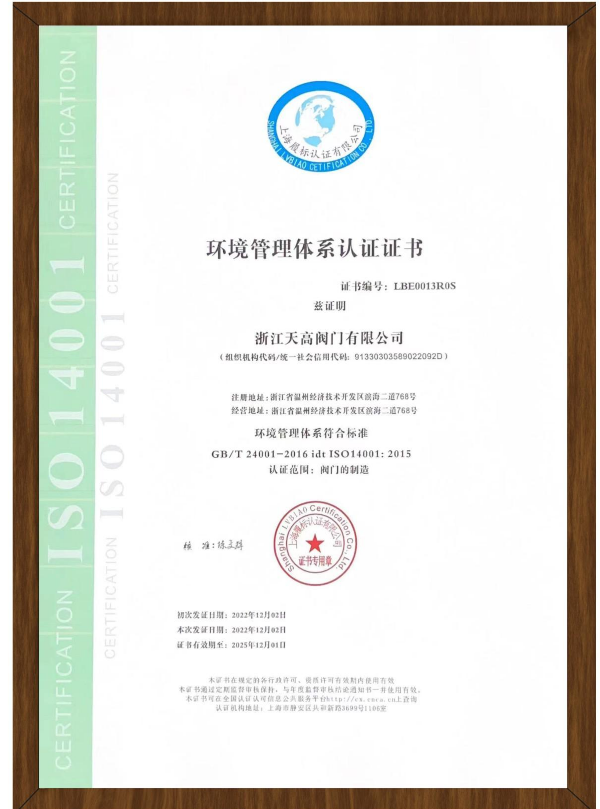
环境管理体系认证证书 ENVIRONMENTAL MANAGEMENT SYSTEM CERTIFICATION