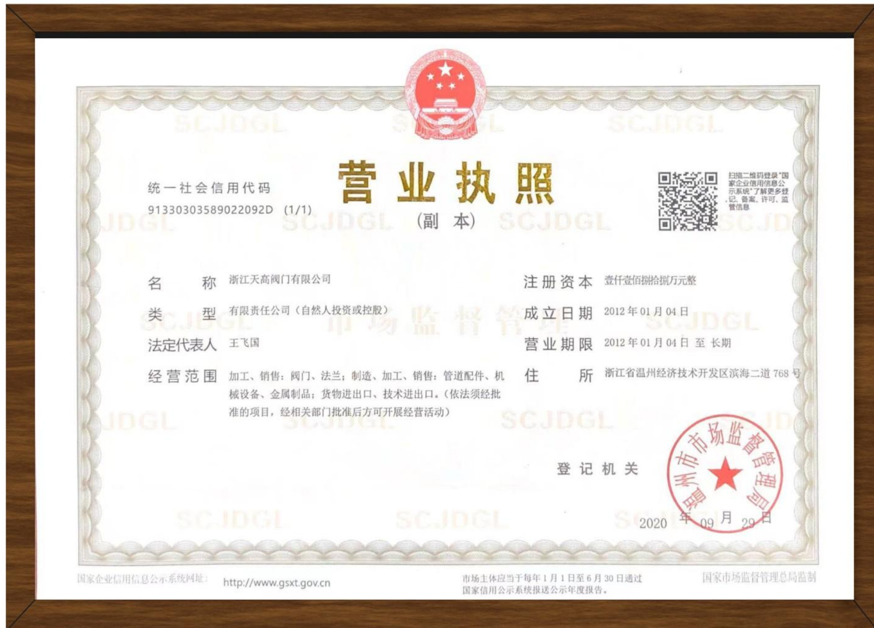
营业执照 BUSINESS LICENSE