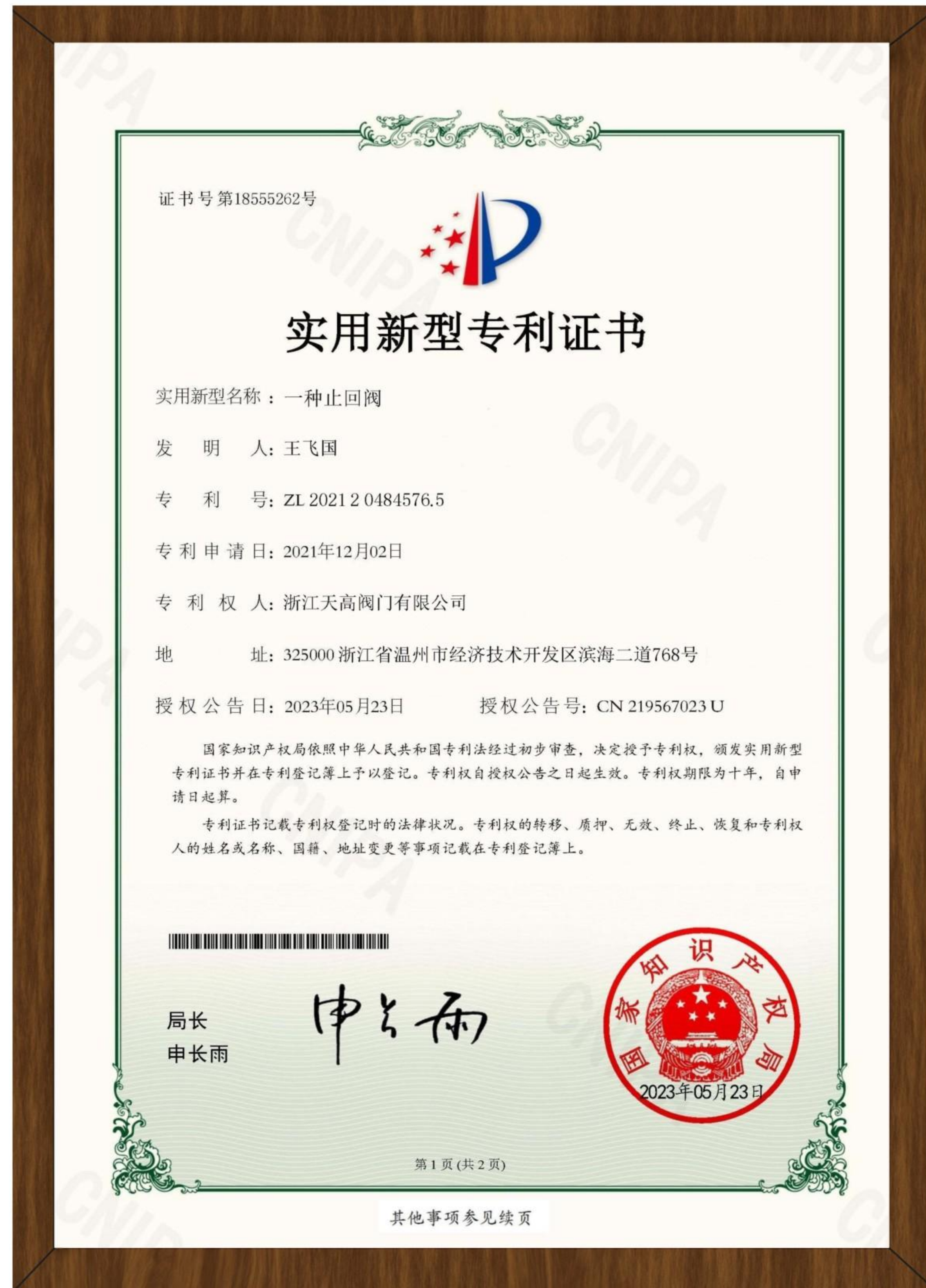
实用新型专利证书（一种止回阀） UTILITY MODEL PATENT CERTIFICATE (A TYPE OF CHECK VALVE)