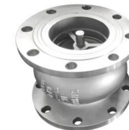
HC41消声法兰止回阀 HC41 Silence Flange Check Valve