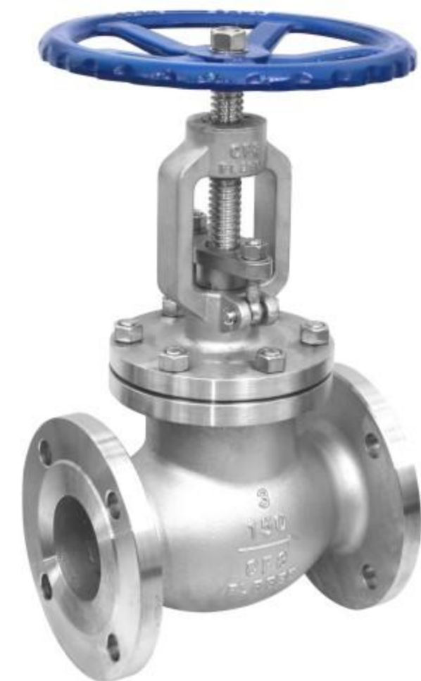
美标法兰截止阀 API Flange Globe Valve