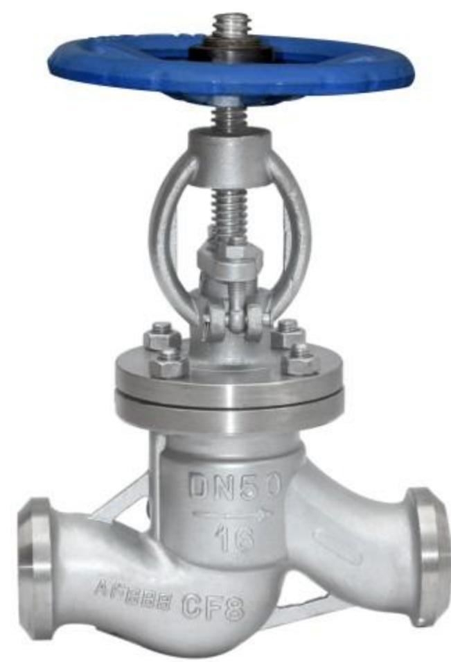
焊接截止阀 Welding Globe Valve