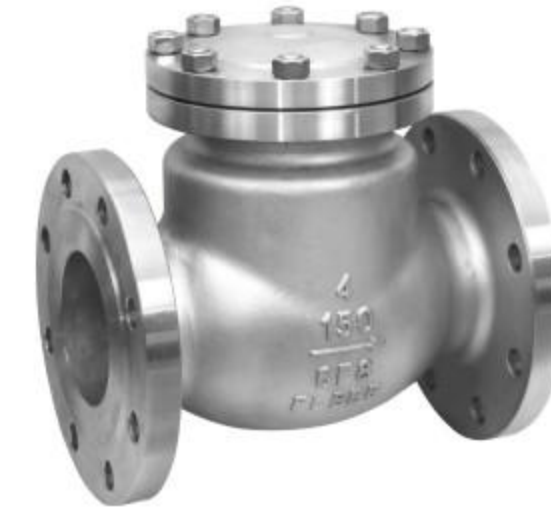
H44美标法兰止回阀 H44 API Flange Check Valve