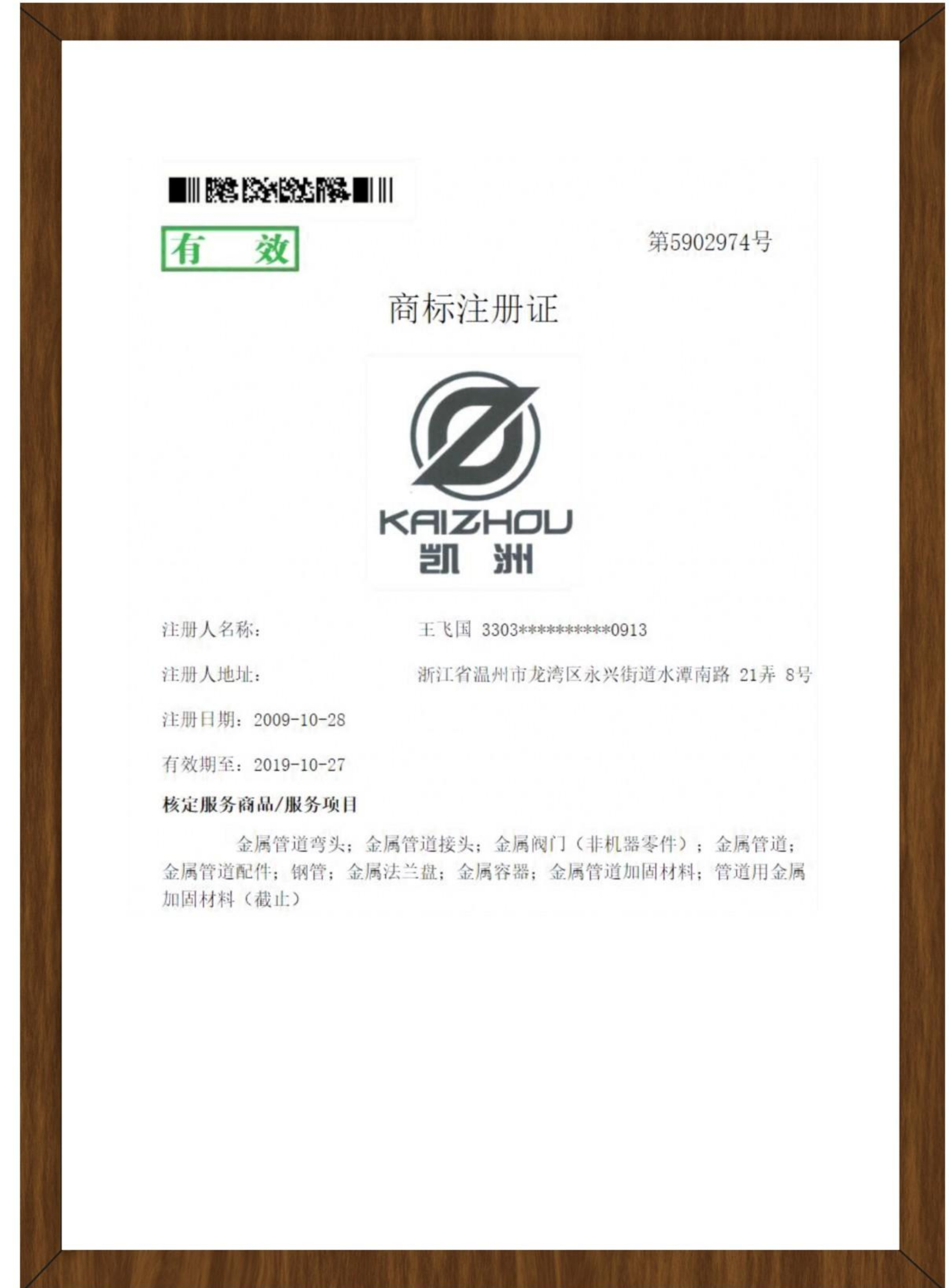
商标注册证 TRADEMARK REGISTRATION CERTIFICATE