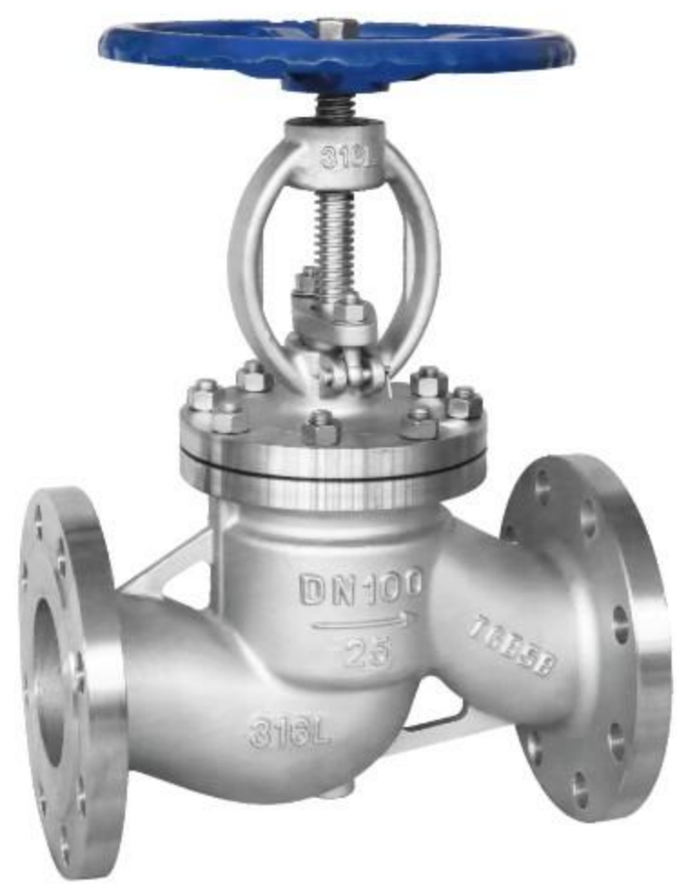
国标法兰截止阀 GB Flange Globe Valve