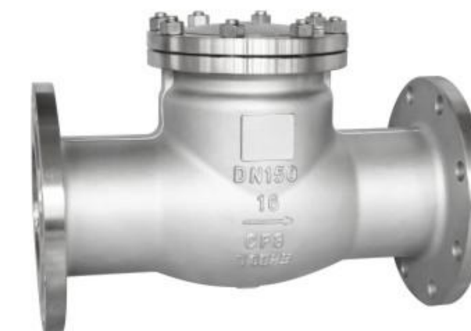
H44旋启式法兰止回阀 H44 Swing Flange Check Valve