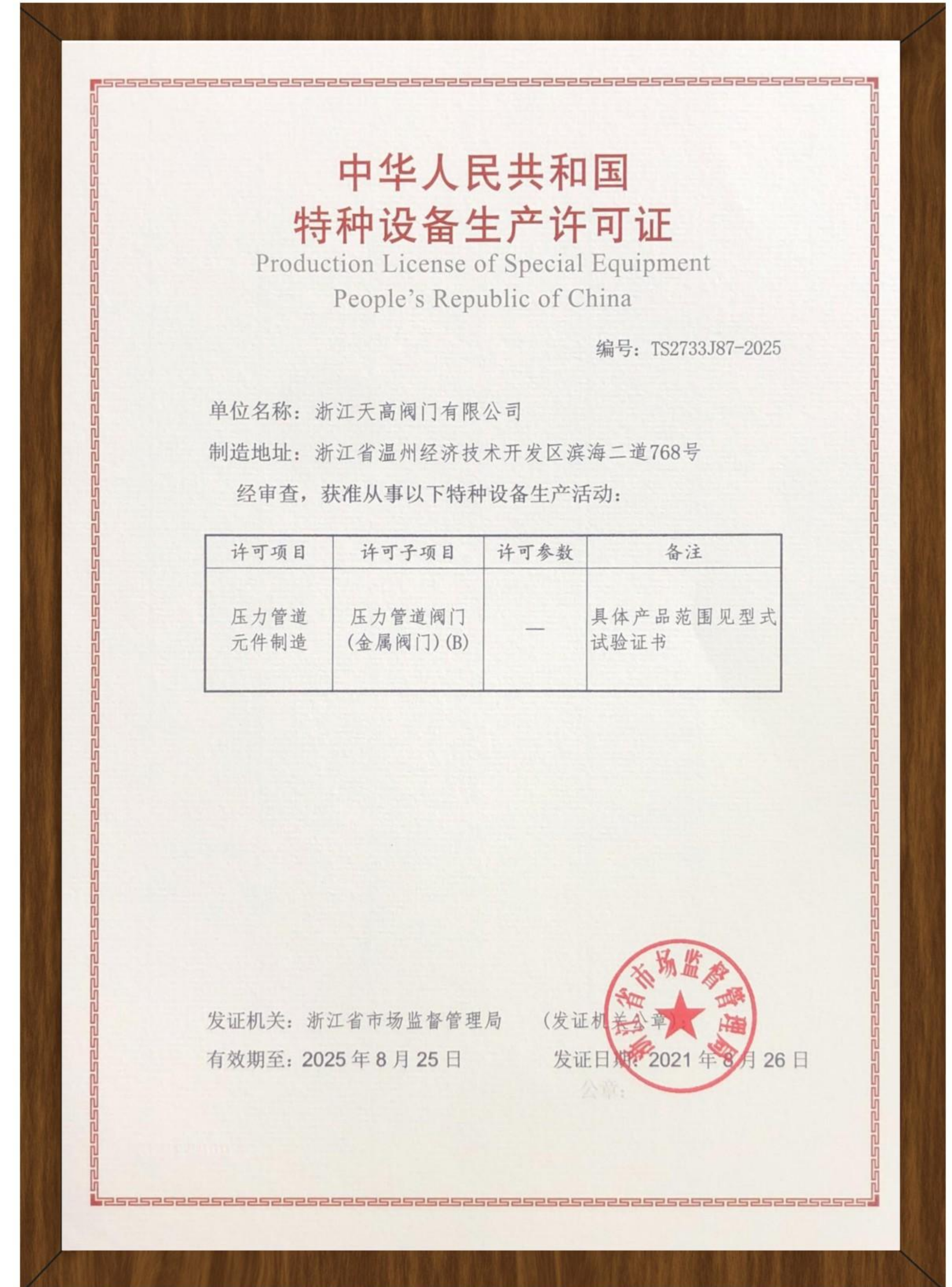
特种设备生产许可证 SPECIAL EQUIPMENT PRODUCTION LICENSE