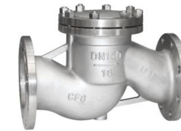
H41升降式法兰止回阀 H41 Lifting Flange Check Valve