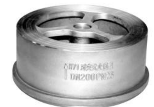
H71对夹升降式止回阀 H71 Wafer Lift Check Valve