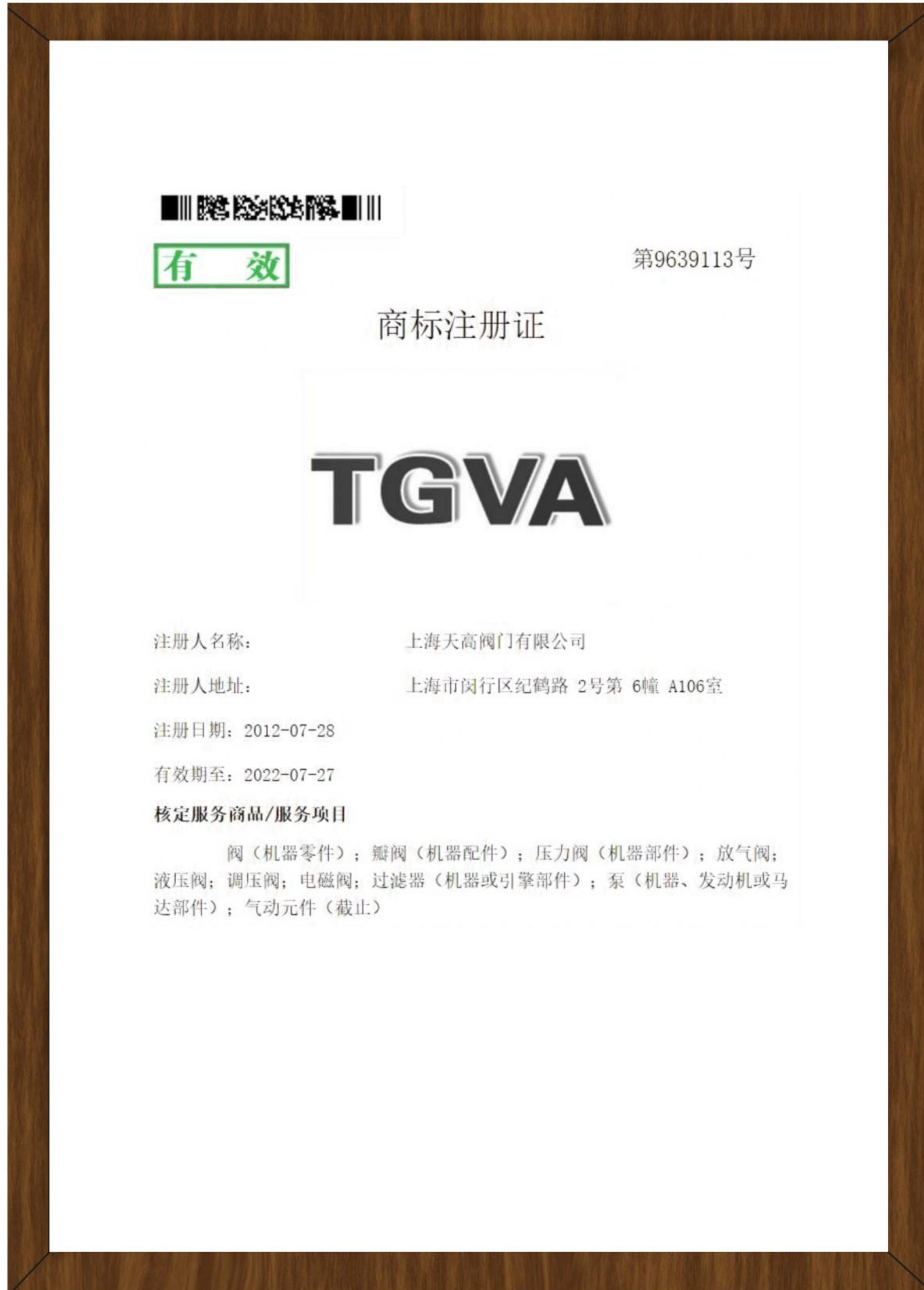
商标注册证 TRADEMARK REGISTRATION CERTIFICATE