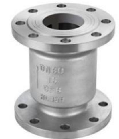
H42立式法兰止回阀 H42 Vertical Flange Check Valve