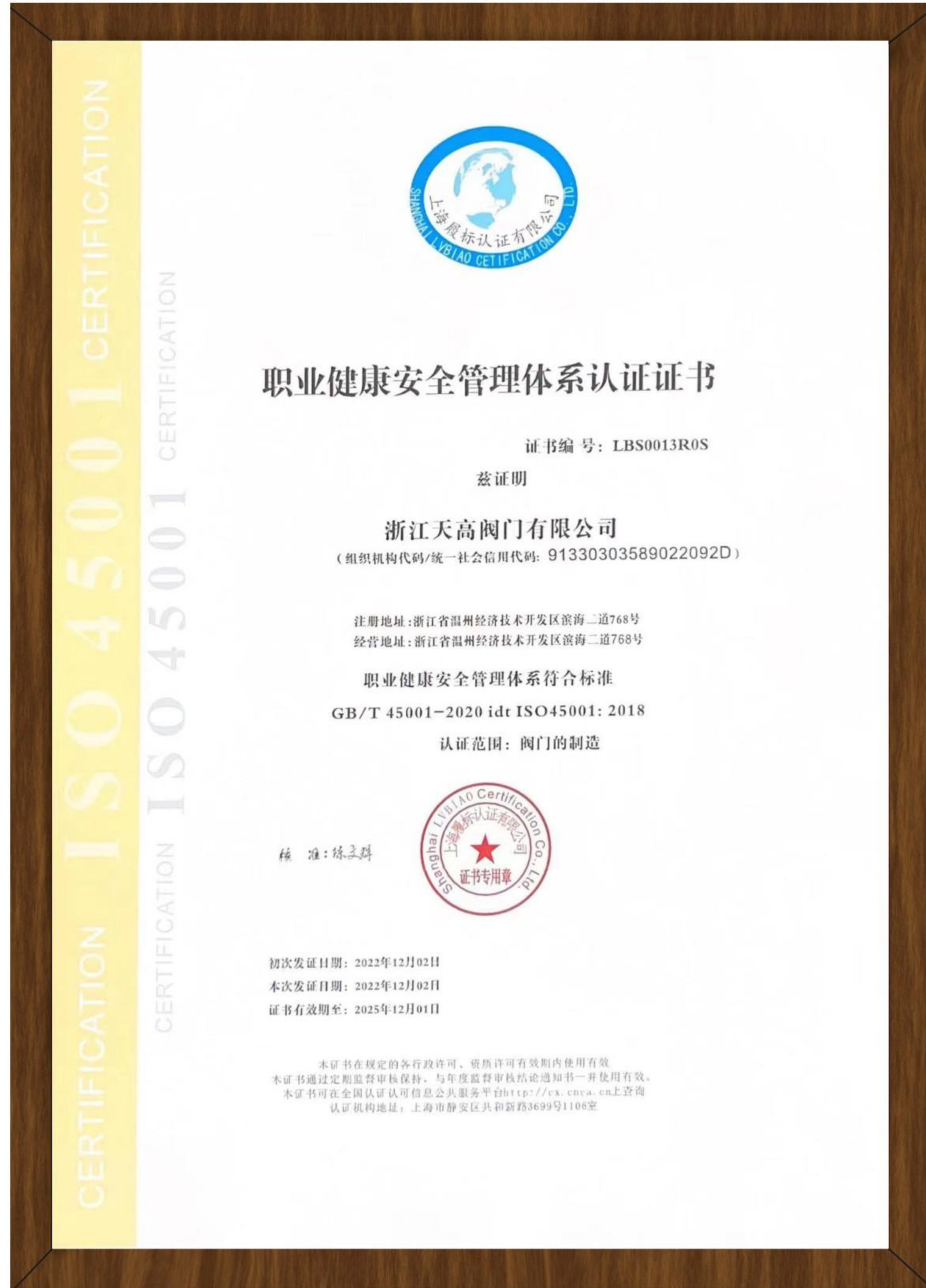
职业健康安全管理体系认证证书 OCCUPATIONAL HEALTH AND SAFETY MANAGEMENT SYSTEM CERTIFICATION CERTIFICATE