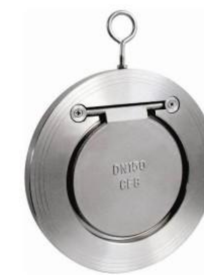
H74对夹圆片止回阀 H74 Wafer Check Valve