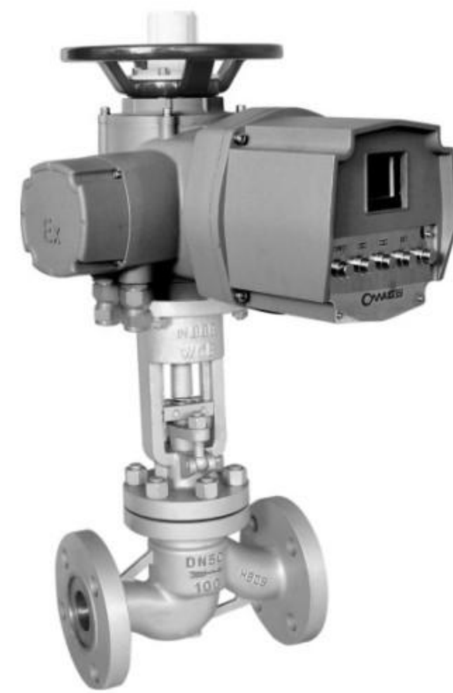
电动截止阀 Electric Globe Valve