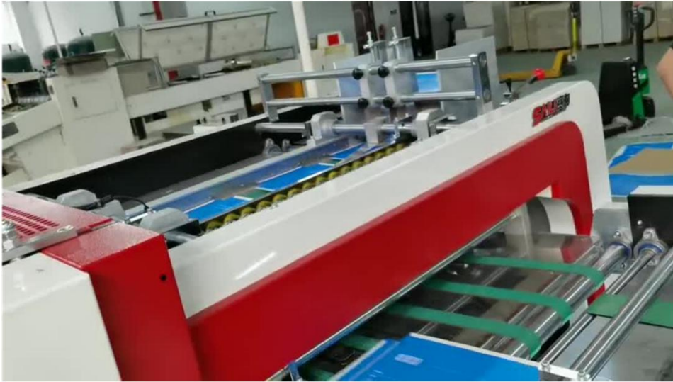
Grooving First Time