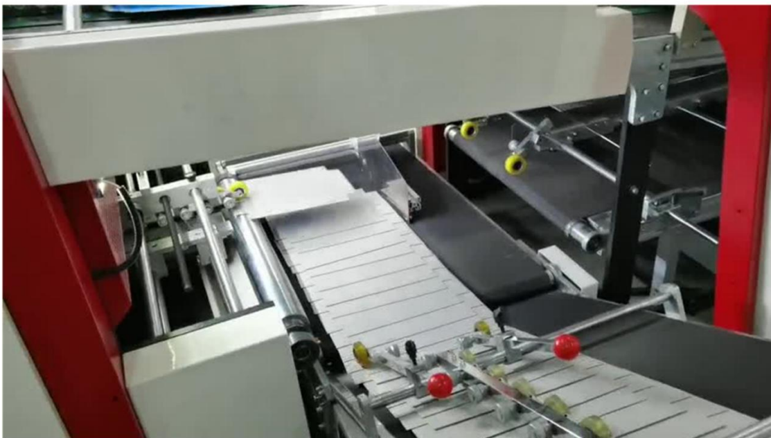
Final Holder Automatically Collect Finished Boards