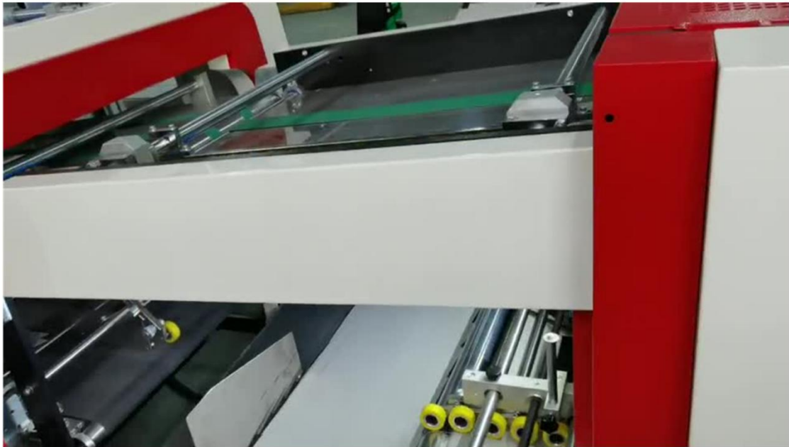
2 nd Grooving With Auto Belt-correction System