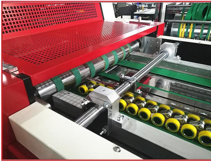
Auto Feeding With Anti-friction Belt