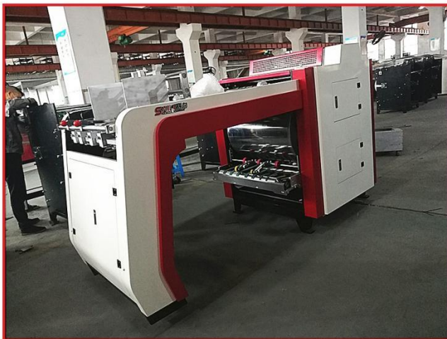
Daily Production --In SAILI Workshop--