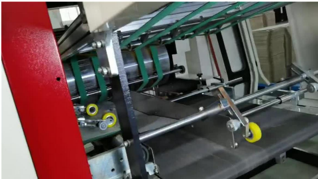
Move to 2 nd Grooving