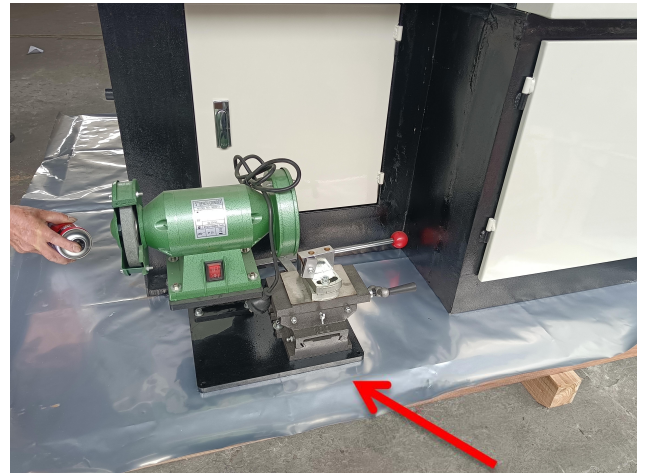
Blade Grinding Tool together with machine