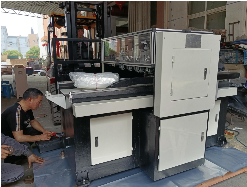
Worm Vacuum Together With machine