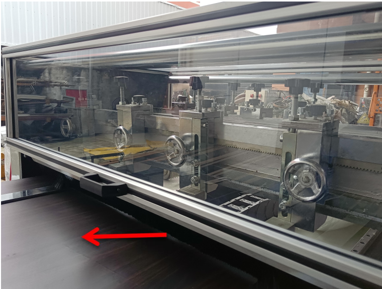
Workbench has protective film