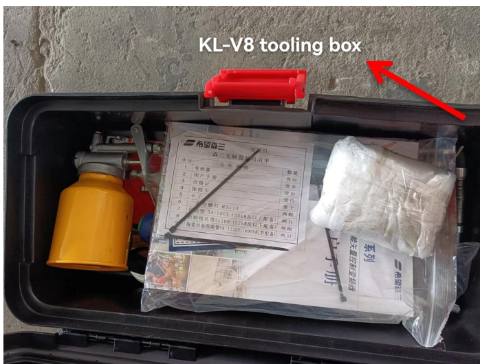
KL-V8 tooling box