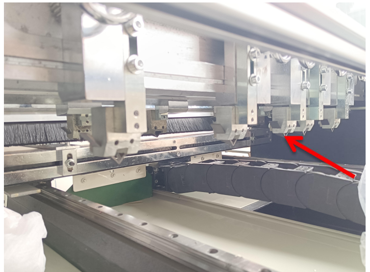
8 sets knife holders assembled in KL-V8 with two rows beam.