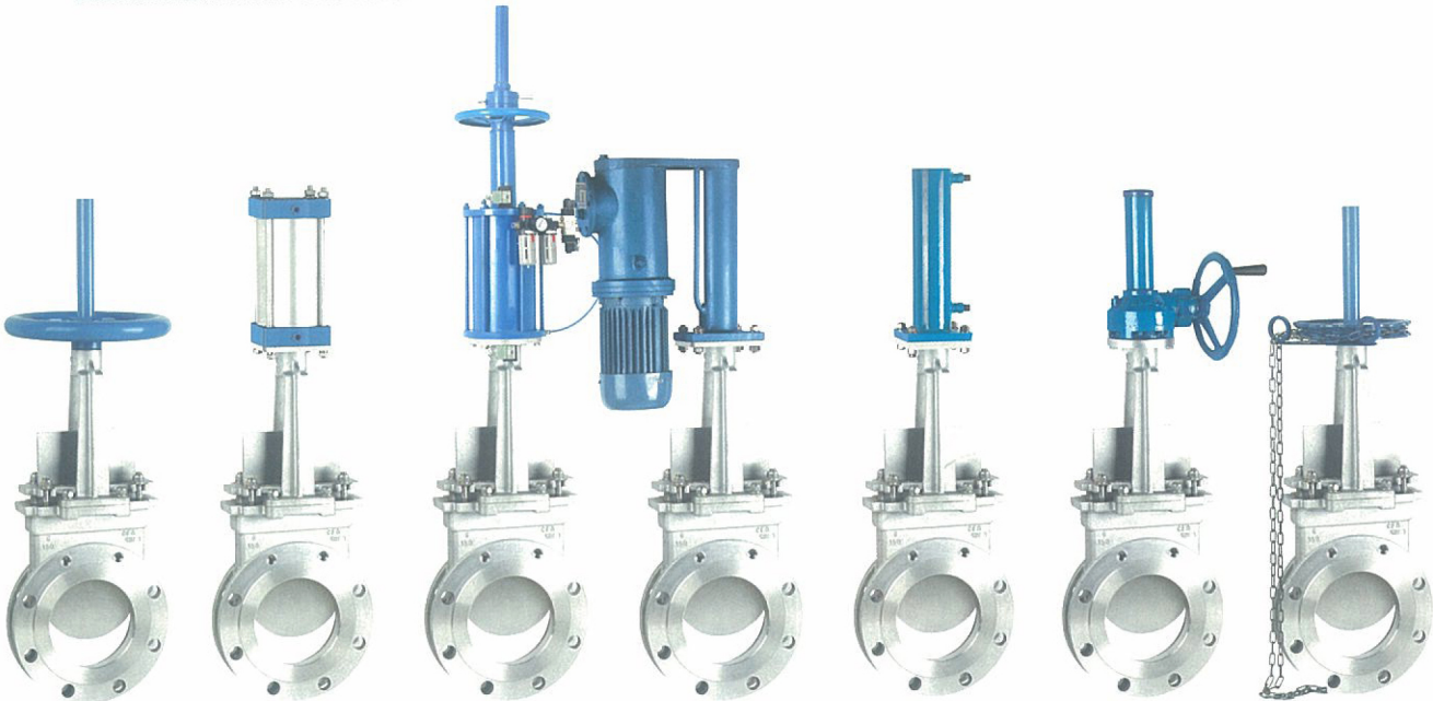
手动 Handle Wheel Knife gate valve