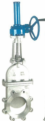
伞齿轮 Bevel Gear Knife Gate Valve