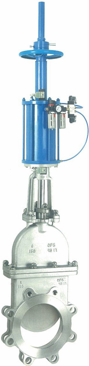
手、气动双用 Manual & Pneumatic Knife Gate Valve