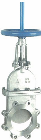
手动 Handle Wheel Knife gate valve