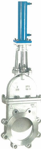
液动 Hydraulic Knife Gate Valve