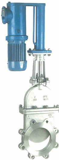
电液动 Electric hydraulic Knife Gate Valve