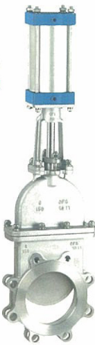
气动 Pneumatic actuated Knife Gate Valve