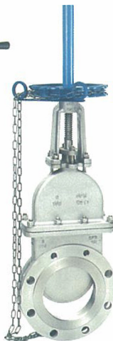
链轮 Chain actuated Knife Gate Valve