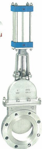
气动 Pneumatic actuated Knife Gate Valve