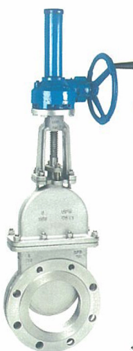
伞齿轮 Bevel Gear Knife Gate Valve