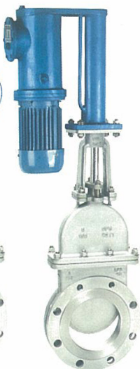
电液动 Electric hydraulic Knife Gate Valve