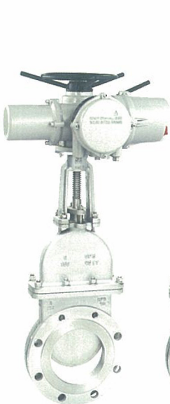
电动 Electric actuated Knife Gate Valve