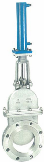
液动 Hydraulic Knife Gate Valve