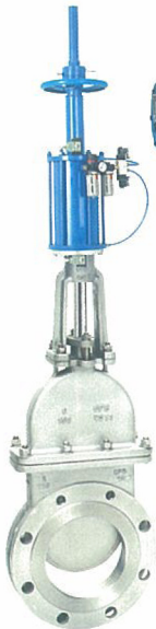
手、气动双用 Manual & Pneumatic Knife Gate Valve