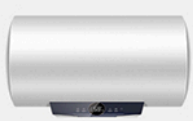
ELECTRIC WATER HEATER