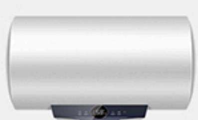
ELECTRIC WATER HEATER